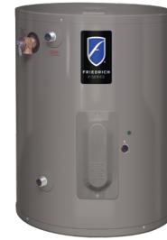
6, 10, 15, 19.9 and 30-Gallon