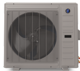
4 ton RD16AY48AJVCA