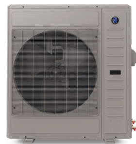
5 ton RD16AY60AJVCA