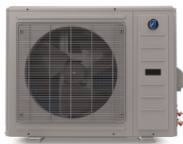
2 ton RD16AY24AJVCA